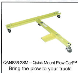
QM4836-2SM – Quick Mount Plow Cart™ Bring the plow to your truck!