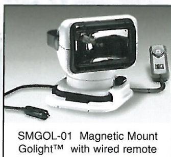
SMGOL-01 Magnetic Mount Golight™ with wired remote

*Components of kit depend on model of plow.